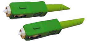
SC/APC Connector (Φ0.9mm,1.5m)