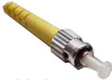
Singlemode ST Connector