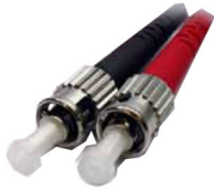
Multimode ST Connector